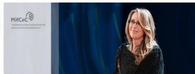
ВАЖНОЕ МИСИС «Открытый ректорат» для иностранных студентов #СОБЫТИЕМИСИС 25 мая, 16:30, 5-3

Like every month, this month International Office at NUST MISIS brought some great news and events you all can enjoy. May is a month of holidays students use to enjoy every day of this beautiful summer at the university as well as outside. In addition to thriving academically, we want to see students actively participate in and enjoy their lives at the university and around Moscow. Any feedback on what interests you, publications that you have found useful, or problems that you have encountered are most welcome. Please forward them directly to mp@misir.ru