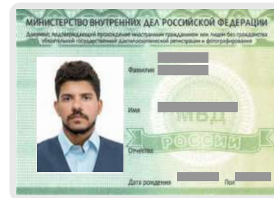
Certificate of fingerprint registration